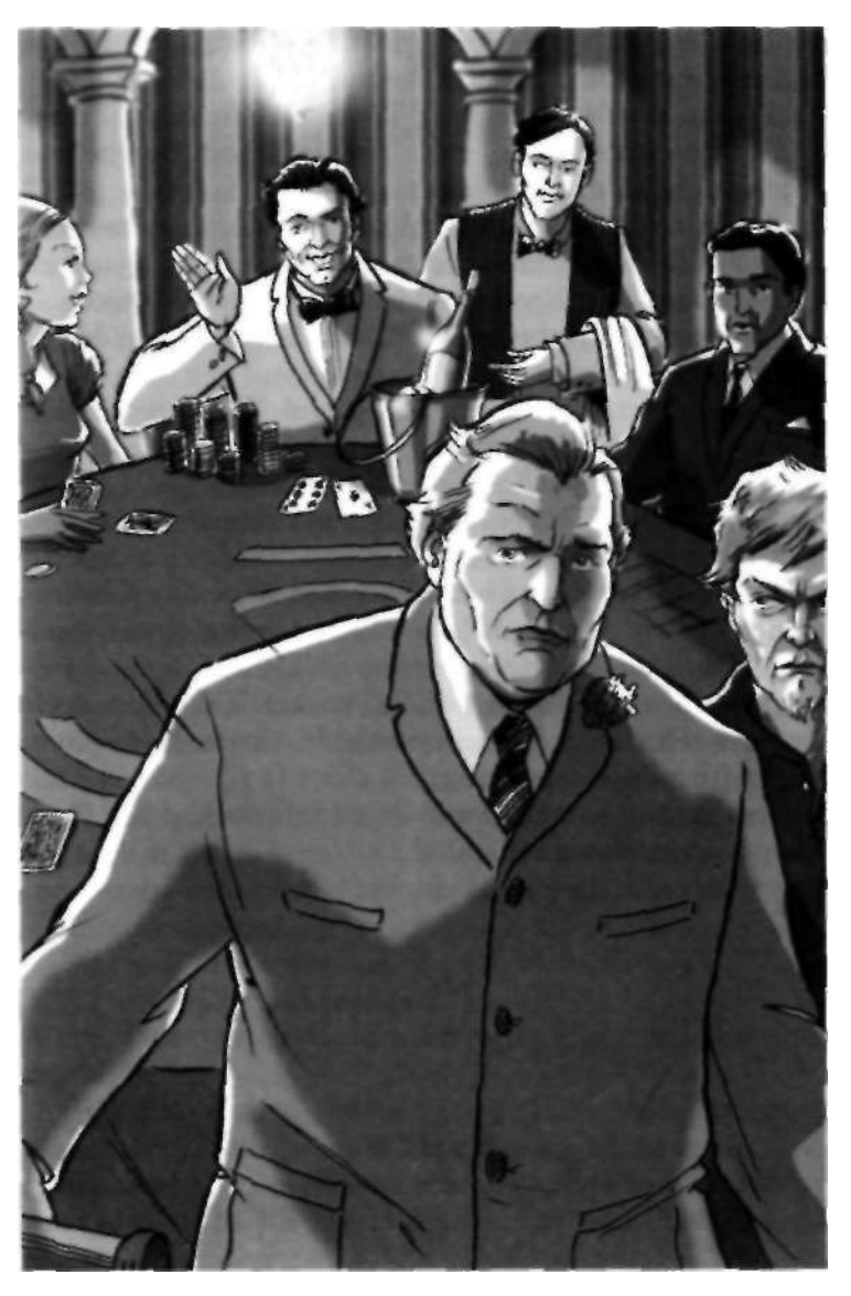
Le Chiffre was like a man who carried the smell of death.