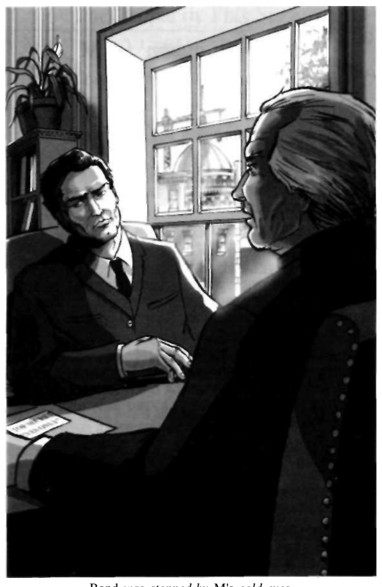
Bond was stopped by M's cold eyes. 'Le Chiffre can have bad luck, too,' M replied.