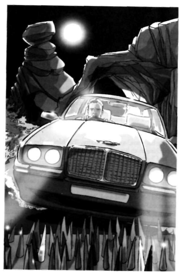
Suddenly there was a 'carpet' of metal spikes wider Bund's wheels.