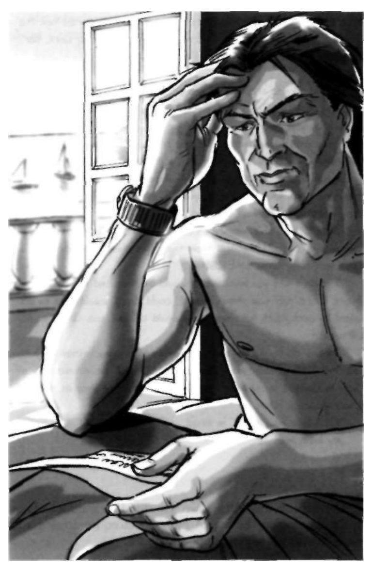
It was not a long letter. After the first few words, Bond read it