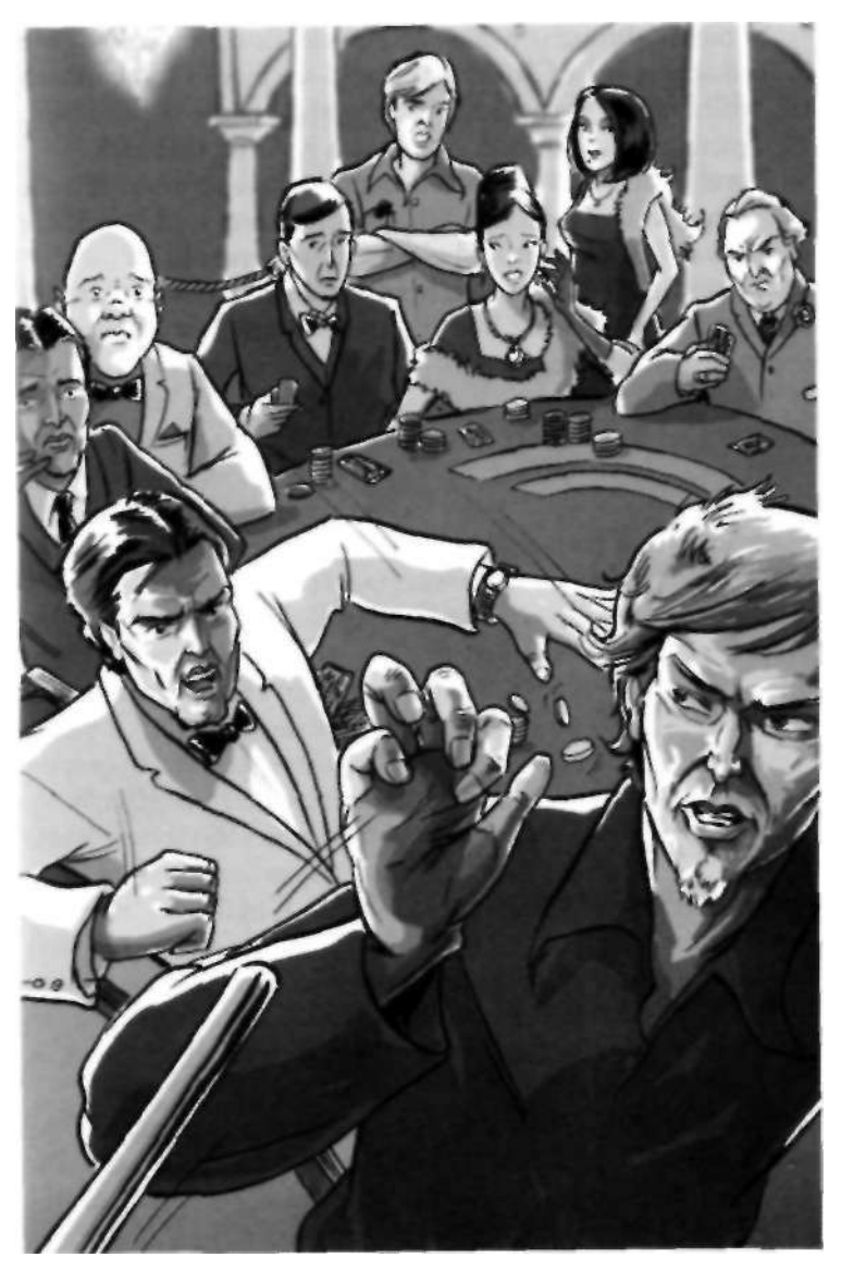
Bond moved so fast that the chair knocked the 'stick' from the gunman's hand.