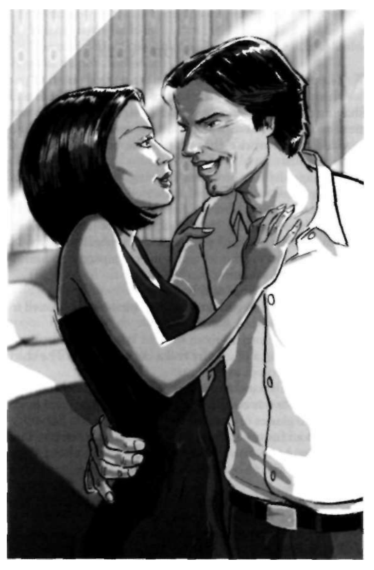
Vesper's eyes were shining and she put her hand on Bond's arm.