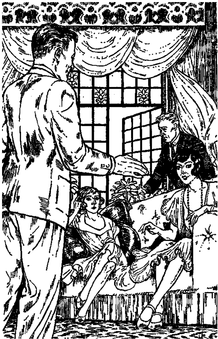
Two young women were sitting on an enormous couch.