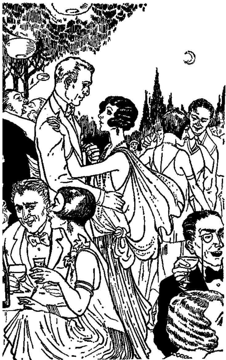
Daisy and Gatsby danced together.