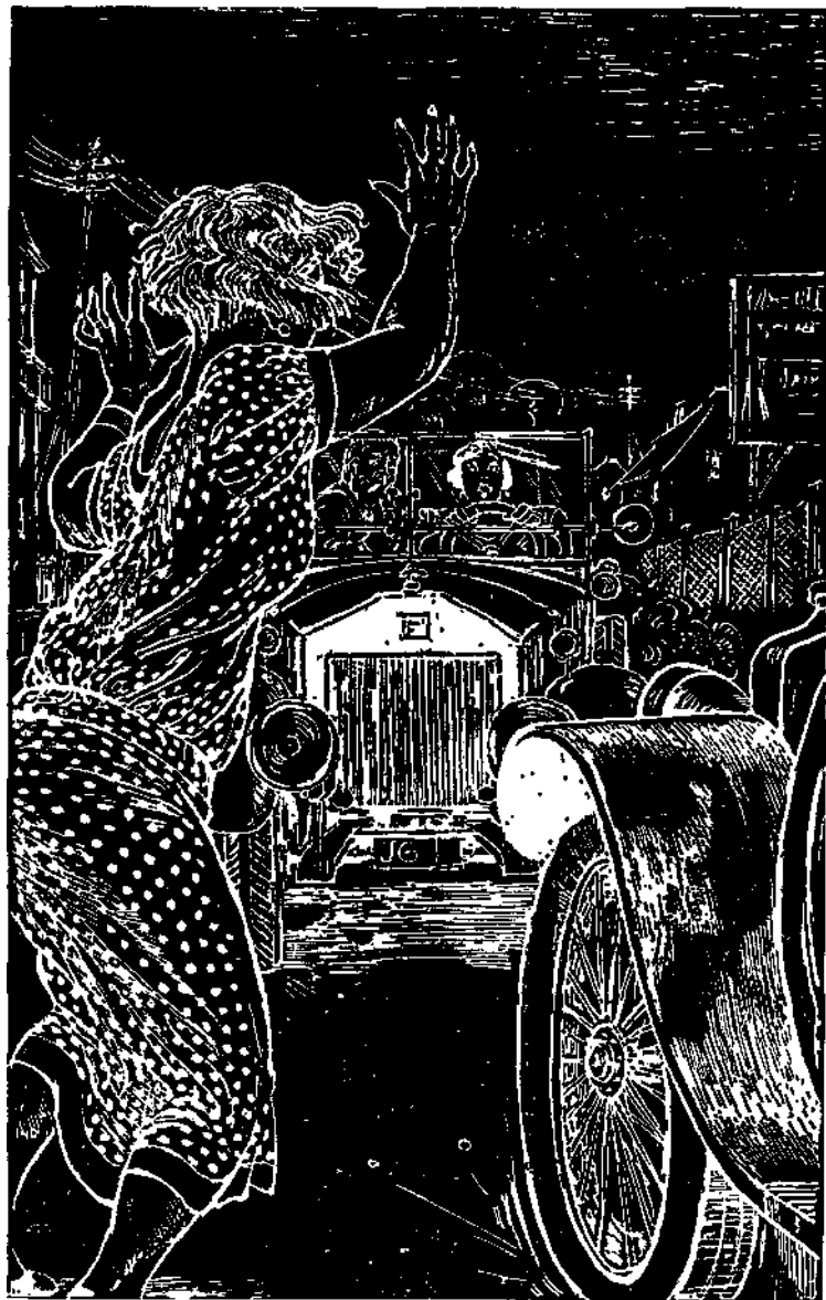
'That woman rushed into the road just as a car was coming the other way.'