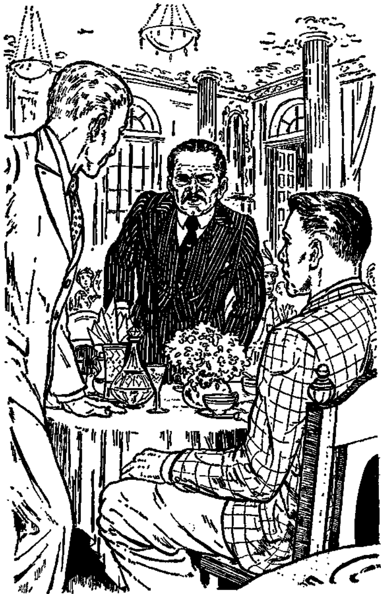
When Gatsby came back to our table, Mr Wolfsheim got to his feet and looked round the room.