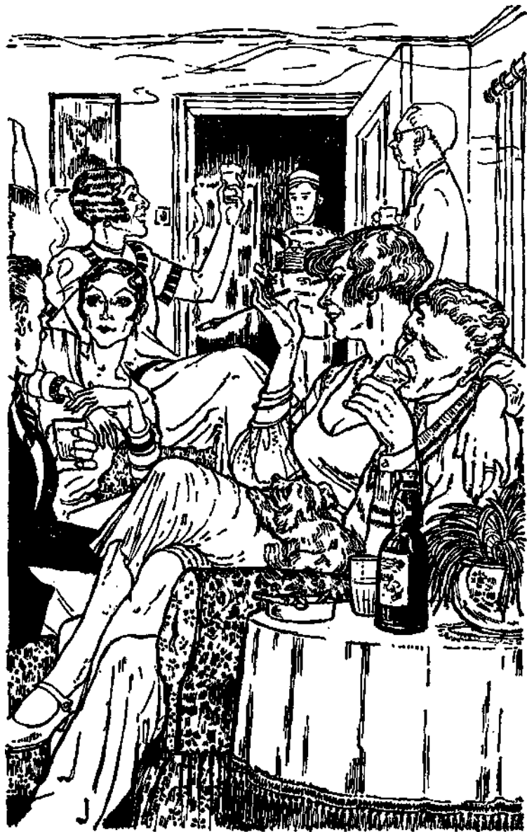
The room was filled with Myrtle's loud, false laughter.