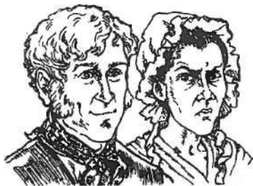
Joe Gargery Mrs Joe