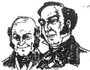
Wemmick Mr Jaggers