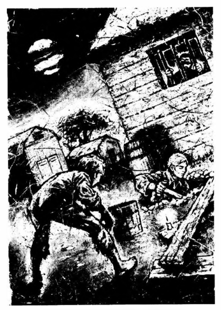
We dug a hole right under the wall of the hut.