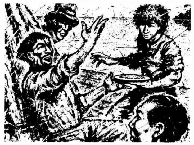
'Bring me my dinner!' said the Duke.

So we did things for him, and he liked it. But the old man