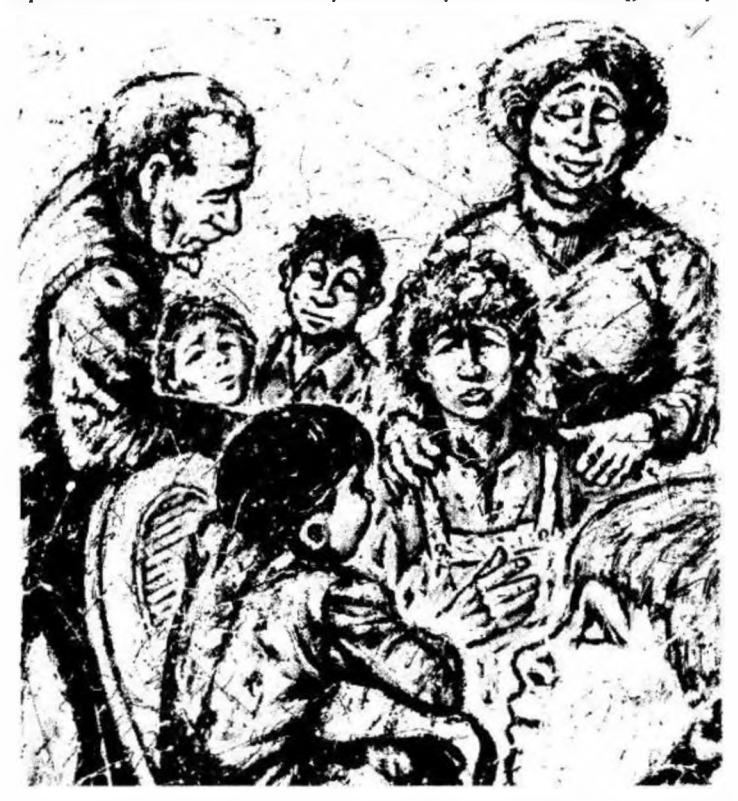
We all sat there talking and I could answer all their questions.