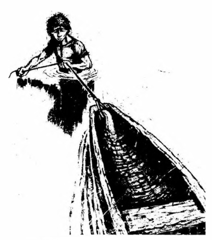
I jumped into the river and brought the canoe to the side.

'He won't be back tonight,' I thought, so I began to work hard at my hole. Soon I could get out through it, and I carried food and drink and Pop's gun down to the canoe. Then I put back the wood to hide the hole, took the gun and