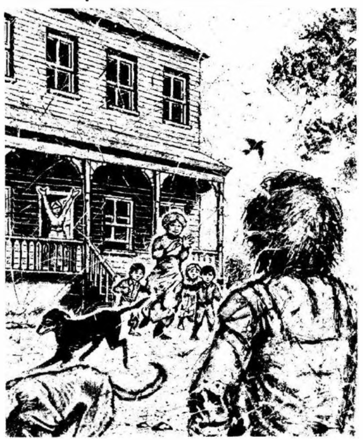
She was smiling all over her face.

I didn't stop to think. 'Yes, ma'am,' I said.