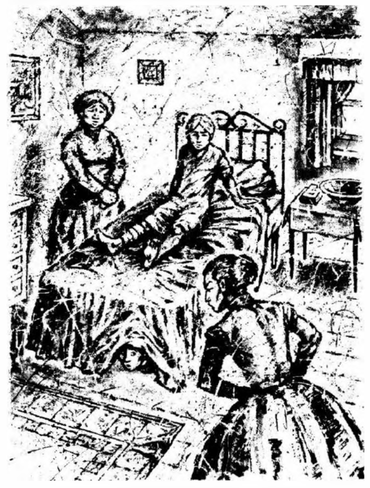
'Come out from under that bed, Huck Finn.'

'Where's Huck Finn, you mean,' replied Aunt Polly. 'Come out from under that bed, Huck Finn.'