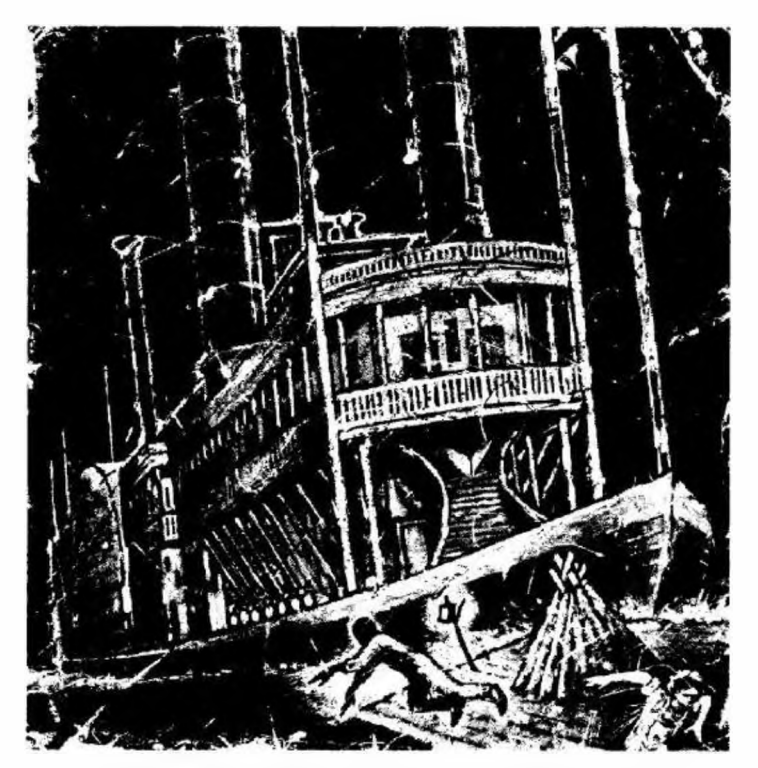
The next minute the steamboat was right over us.

good meal. I told them that my family were all dead, so they said I could stay with them as long as I wanted. It was a beautiful house and the food was good there, so I stayed.