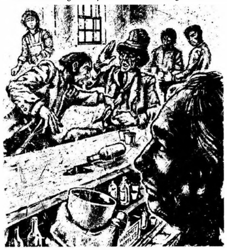
We found the King in a bar, drunk.

'Now we can get away from them,' I thought. I turned