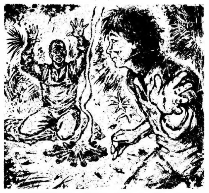
Jim fell to his knees. 'Please don't hurt me!' he cried.

Jim fell to his knees. 'Please don't hurt me!' he cried. 'I've always been good to dead people!'