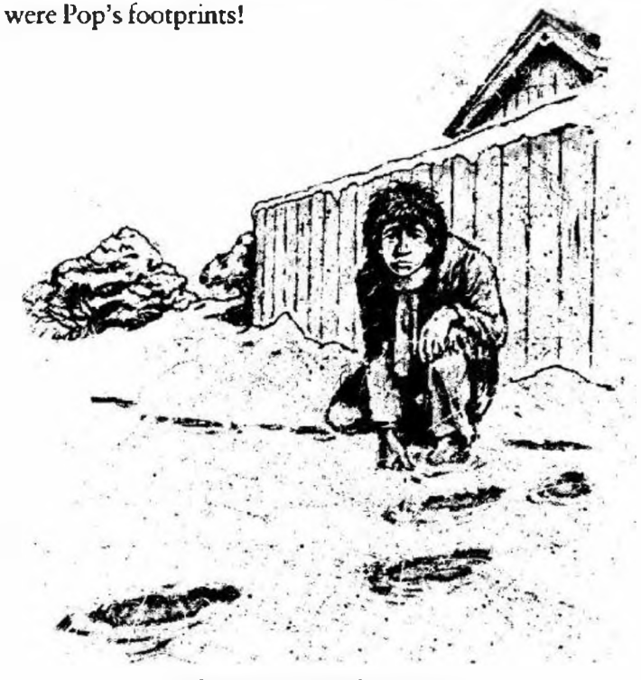
They were Pop's footprints!

Then, one morning, there was some new snow on the ground and outside the back garden I could see footprints in the snow. I went out to look at them more carefully. They