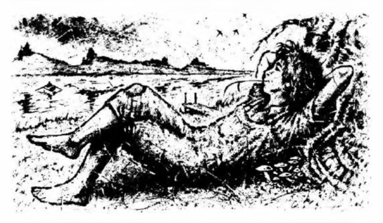
I could do what I wanted, when I wanted. It was a fine life.

In those days I never had a home or went to school like Tom and all the other boys in St Petersburg. Pop was always drunk, and he moved around a lot, so he wasn't a very good father. But it didn't matter to me. I slept in the streets or in the woods, and I could do what I wanted, when I wanted. It was a fine life.