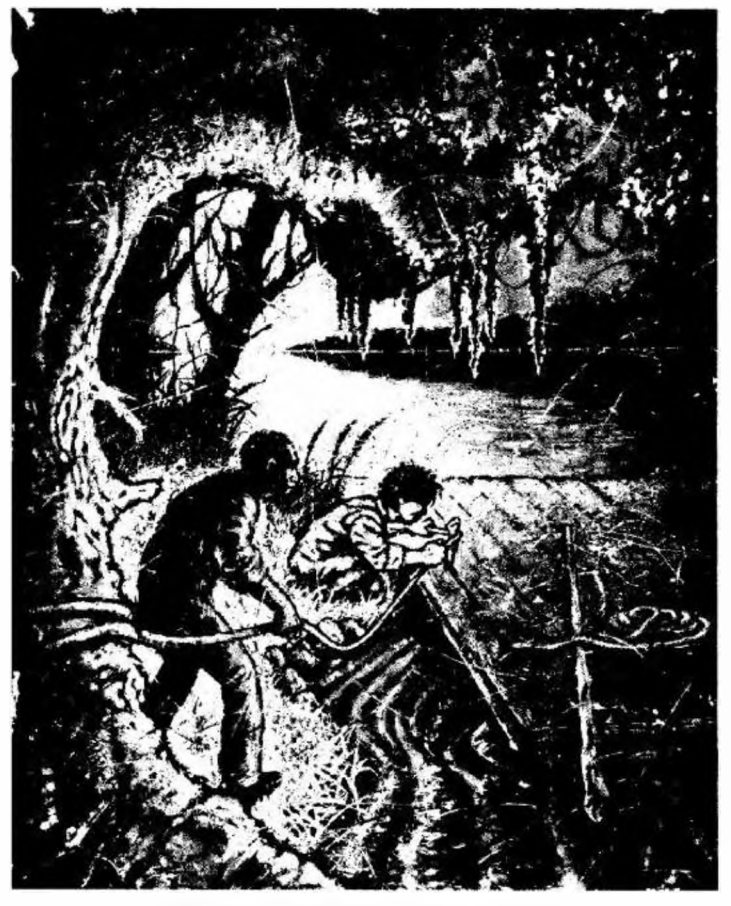
We tied the raft up under the trees.

and was about four metres by five metres. 'This could be useful,' I said to Jim, so we pulled it back to the island behind the canoe, and tied it up under the trees.