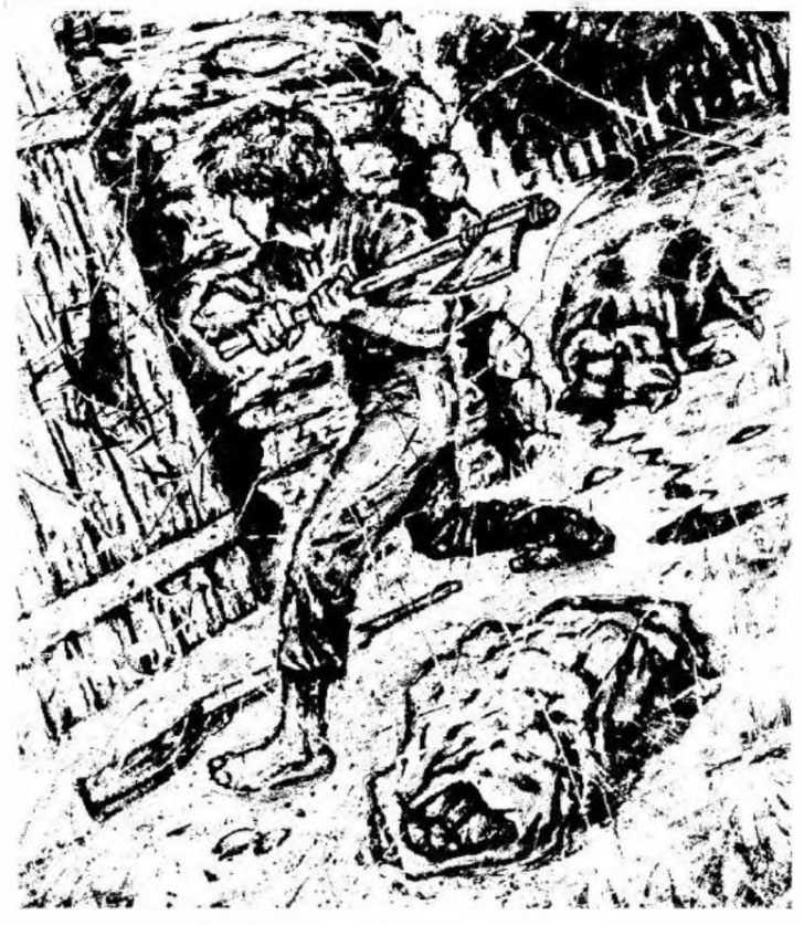
I broke down the door with an axe.

went into the woods. There I shot a wild pig and took it back to the hut with me. Next, I broke down the door with an axe. I carried the pig into the hut and put some of its blood on the ground. Then I put some big stones in a sack and pulled it along behind me to the river. Last of all, I put some