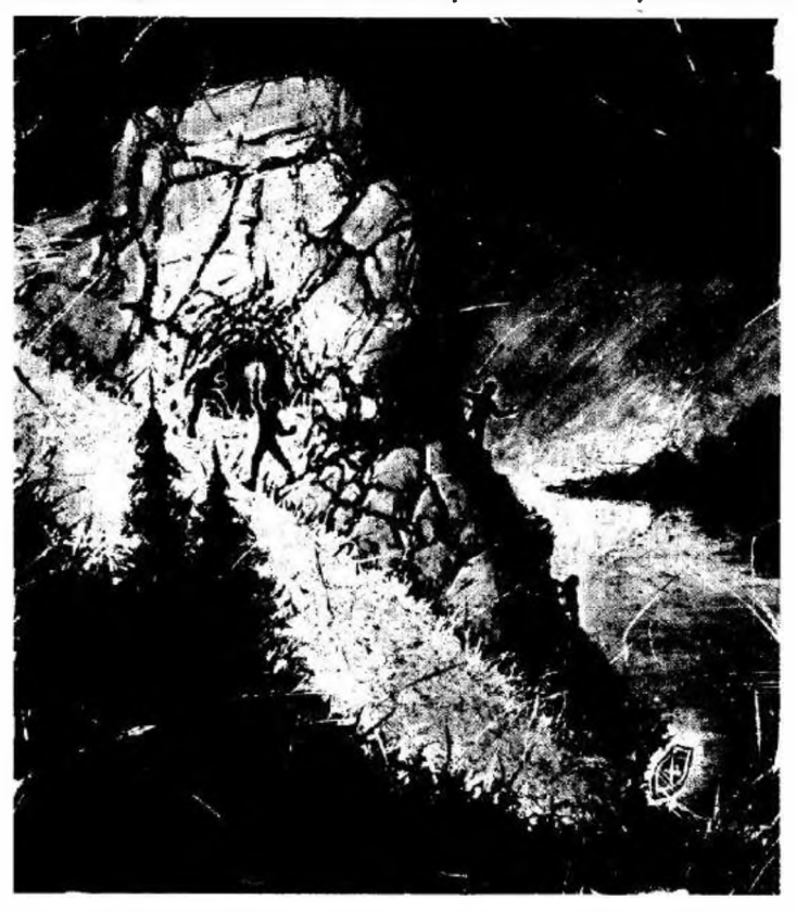
Tom's secret place was a cave, deep in the side of a hill.

'Now, we'll have this gang of robbers,' he said, 'and we'll call it Tom Sawyer's Gang. If somebody hurts one of us, the others will kill him and his family. And if a boy from the