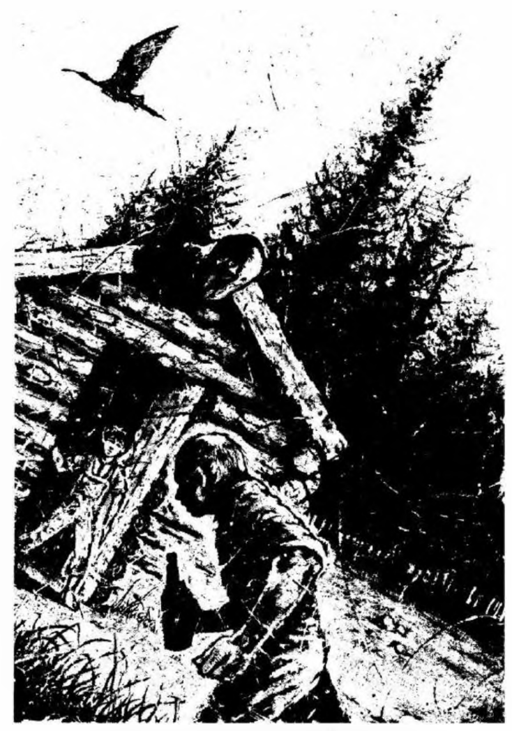
I had to stay with him in a hut in the woods.