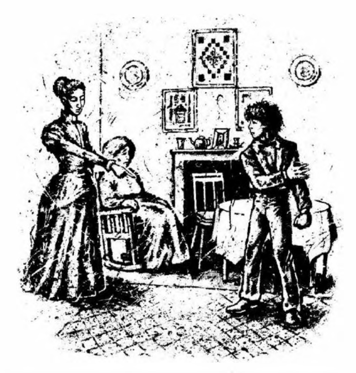
Miss Watson was angry, but the widow just looked unhappy.

Time went on and winter came. I went to school most of the time and I was learning to read and write a little. It wasn't too bad, and the widow was pleased with me. Miss Watson had a slave, an old man called Jim, and he and I were good friends. I often sat talking to Jim, but I still didn't like living in a house and sleeping in a bed.