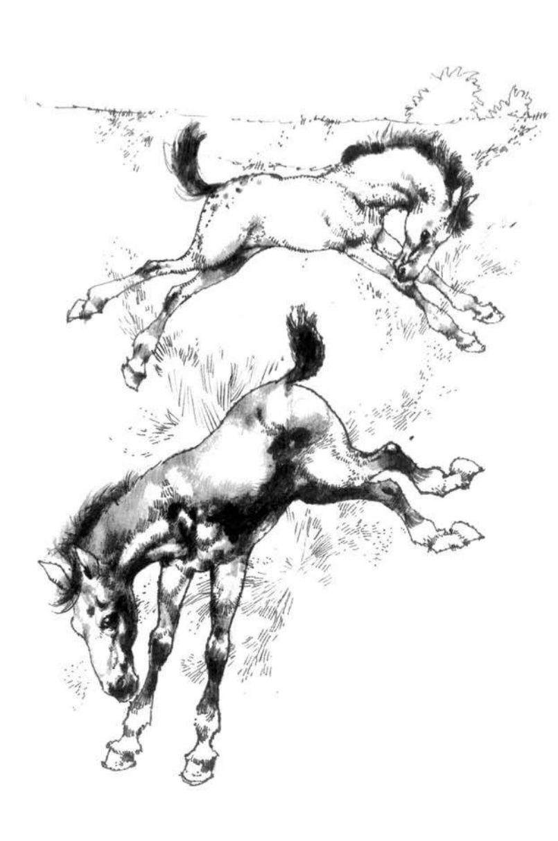
We ran and jumped round and round the field.