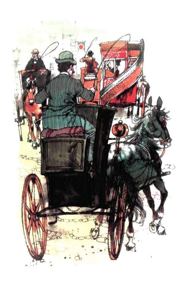
I was a London cab horse!