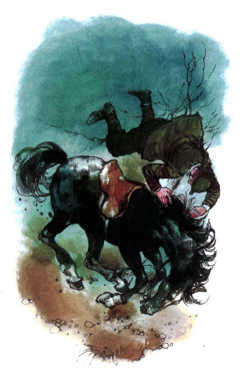
I threw Smith over my head on to the road.