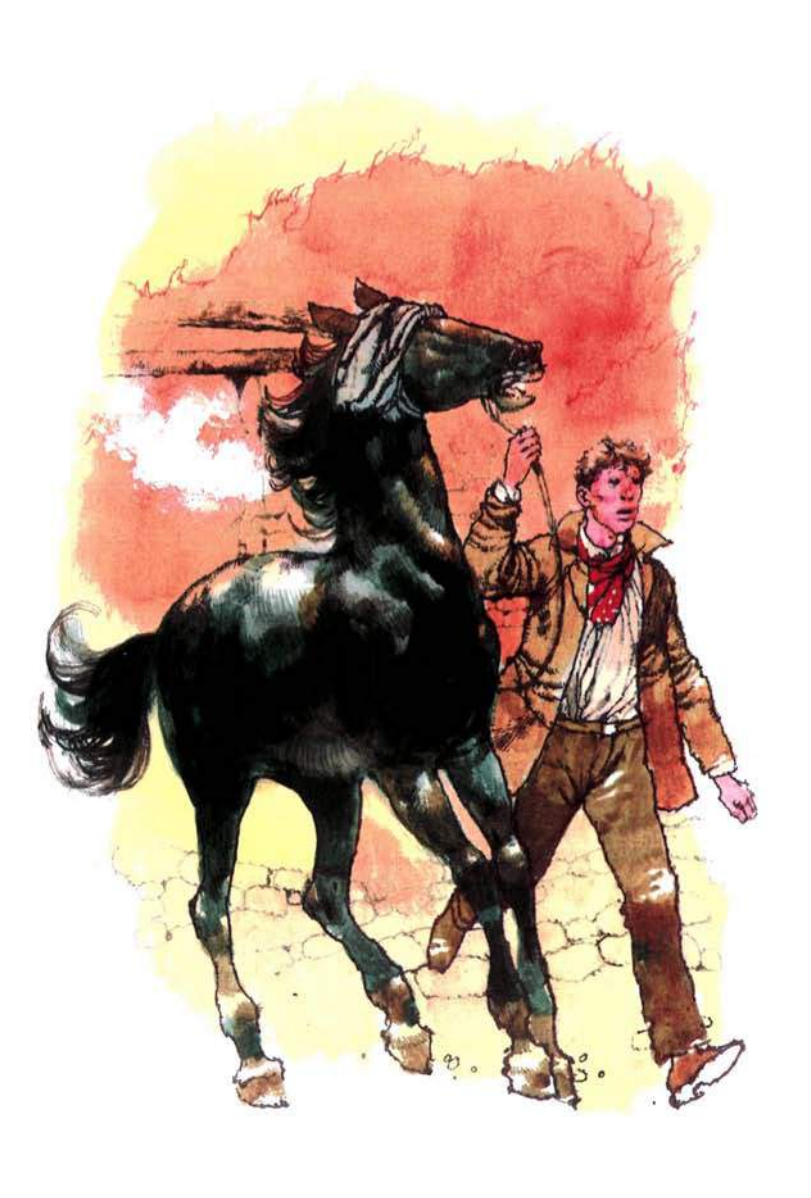
He spoke to me kindly and we walked out of the stable.