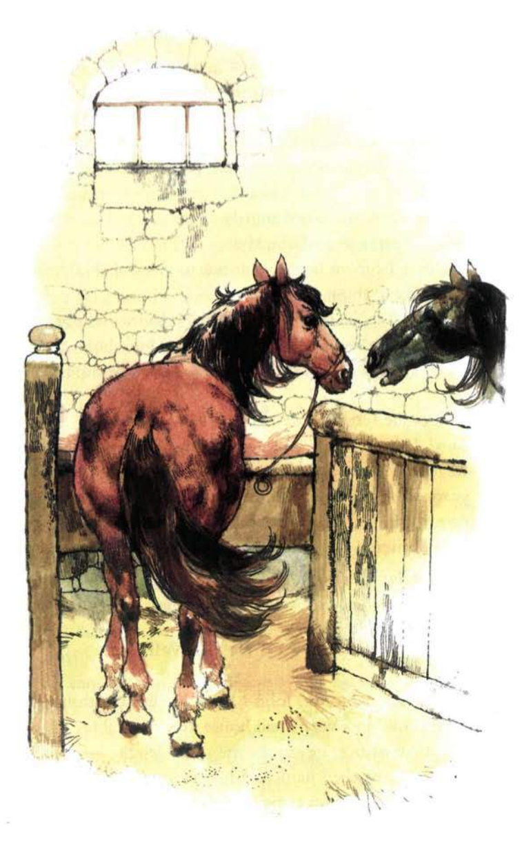
'My name is Merrylegs. I'm very beautiful.'